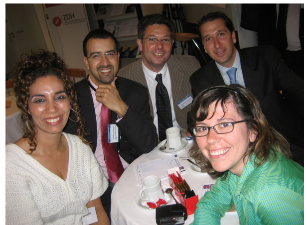
Some members of the Administrative Council